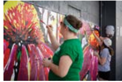
BHSU students and faculty members completed a public art mural on Jackson and 5th Streets in Spearfish in September. The mural was a collaborative project with organizations and students of all ages and abilities from the community participating.

WORKING ON A BIG PROJECT WITH A BUNCH OF PEOPLE, THERE'S SOMETHING TRANSFORMATIVE ABOUT THAT PROCESS. ART CAN BRING PEOPLE TOGETHER.