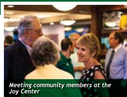
Meeting community members at the Joy Center