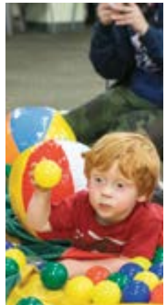
Annual Kiddie Carnival for the community.