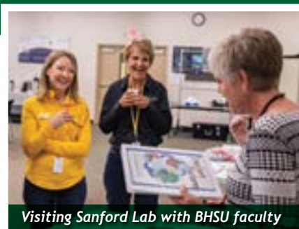
Visiting Sanford Lab with BHSU faculty