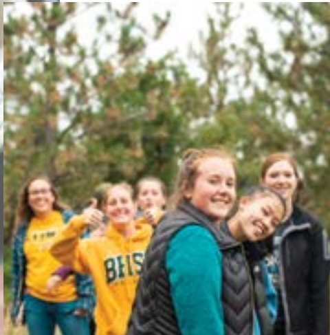
Students participate in a hike to the H during Swarm Week 2019.