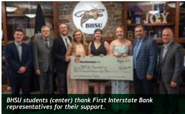
BHSU students (center) thank First Interstate Bank representatives for their support.