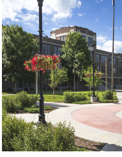
BHSU classes on the Spearfish campus, in Rapid City, and online will all follow the modified academic calendar this fall.