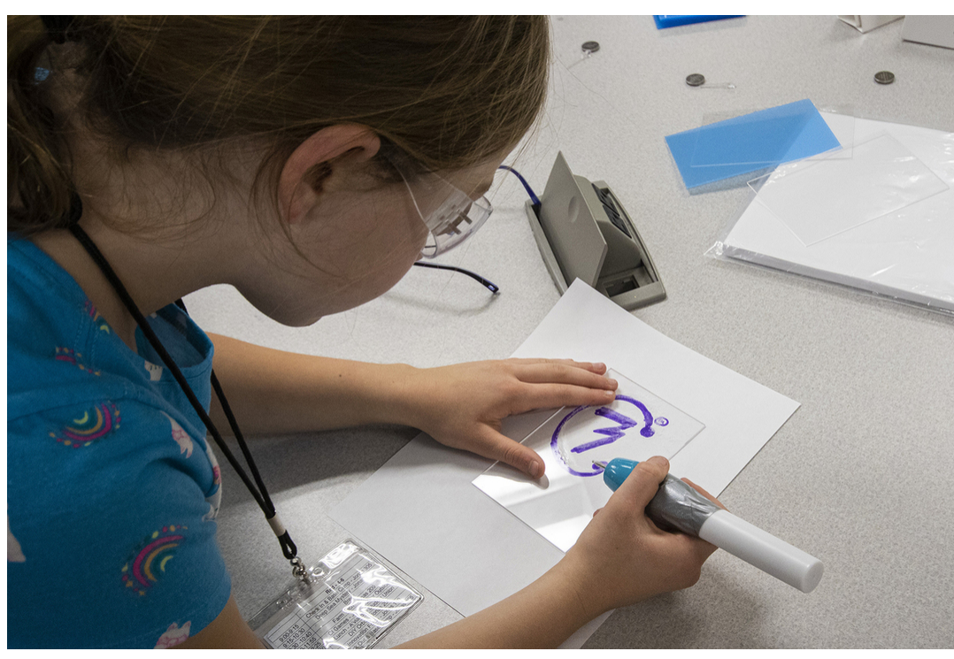
Students will end Camp Invention Elevate at Home with working robots and fun challenges they can continue to build on.

Katie also created free videos on the Art Education with the Dahl Arts Center YouTube page for K-12 students who were learning at home this spring due to school closures. The videos are 10-minute-long lessons on origami, sculpting with paper, mixed media watercolor and collage, and more. Read more