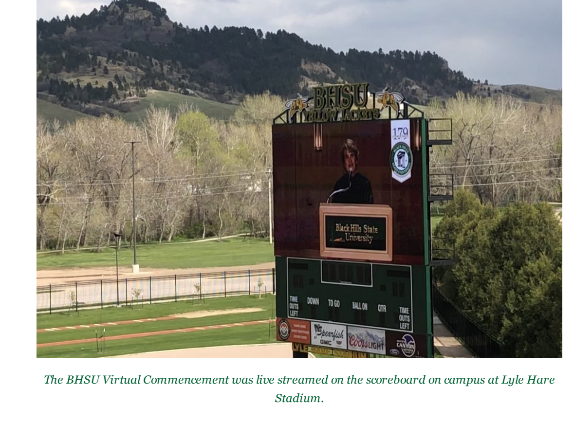
CEREMONY HONORS 300 GRADS Black Hills State University honored the Spring 2020 graduating class with a Virtual Commencement Ceremony Friday, May 8. More than 600 people tuned in to watch the

livestream of Commencement on Facebook and YouTube, and the recording has since been