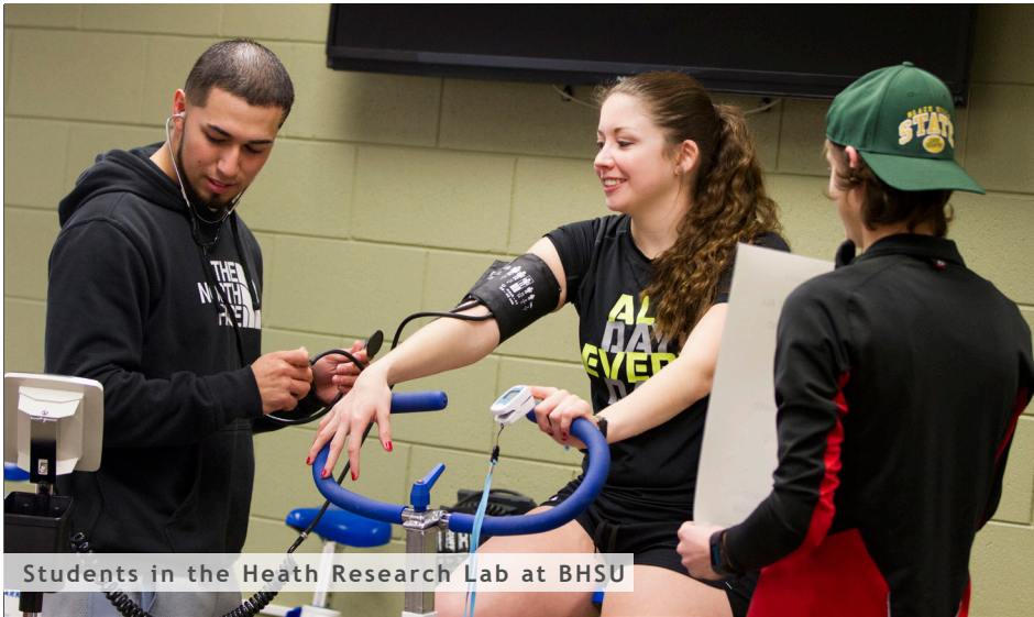
Students in the Health Research Lab at BHSU