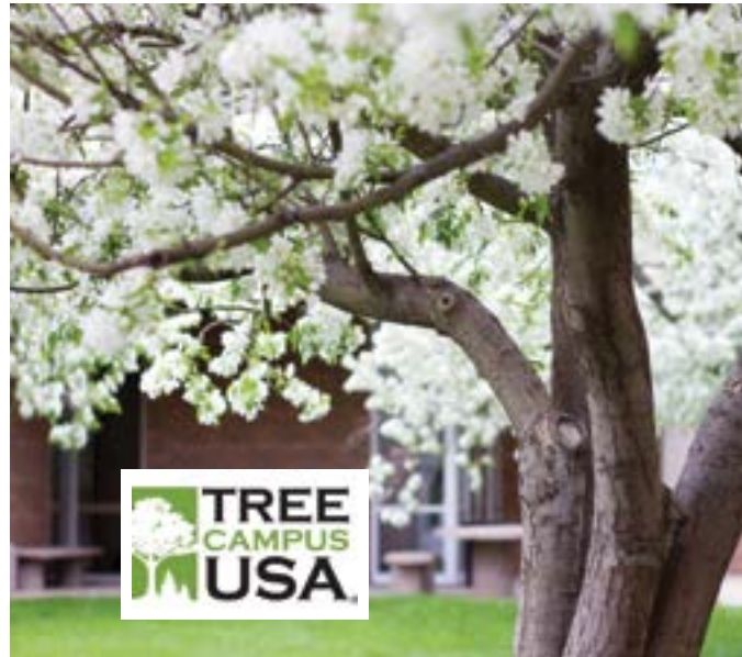
BHSU was recently honored as a 2016 Tree Campus by the Arbor Day Foundation, noting the University's commitment to effective forest management.

Tree Campus USA is a national program created in 2008 by the Arbor Day Foundation to honor colleges and universities for effective campus forest management and for engaging staff and students in conservation goals. Black Hills State University achieved the title by meeting Tree Campus USA's five standards, which include maintaining a tree advisory committee, a campus tree-care plan, dedicated