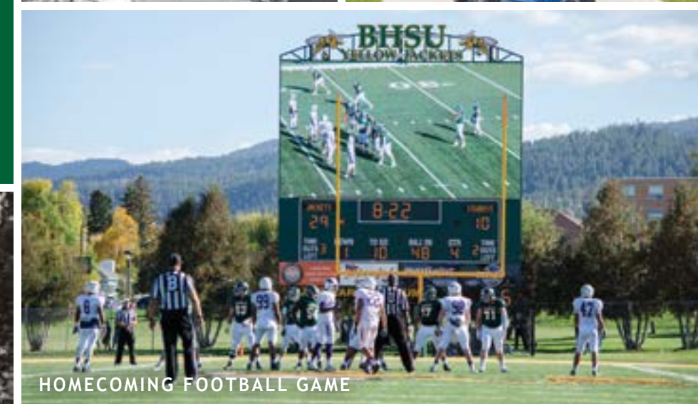
HOMECOMING FOOTBALL GAME