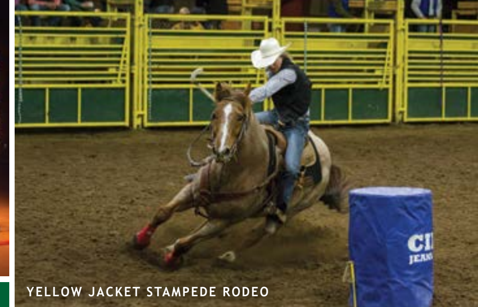
YELLOW JACKET STAMPEDE RODEO