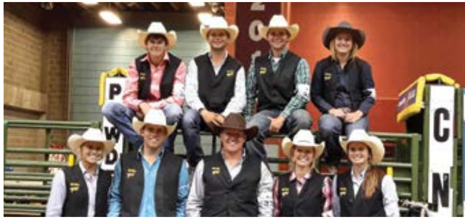
Nine BHSU rodeo athletes competed at the College National Finals Rodeo, the second-straight year both the men's and women's teams qualified for the national competition. The women's team placed sixth.