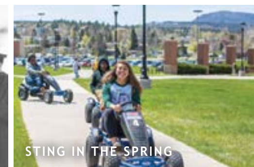
STING IN THE SPRING

Here's to you, Black Hills Jackets and the colors green and gold. You're the pride of every student here. We are behind you firm and bold. And when we students get together, there's nothing that we cannot do for Dear Old B-H-S-U. Black Hills Jackets Here's to you! Here's to you!