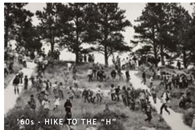
'60s - HIKE TO THE "H"

Listen to the BHSU Fight Song at BHSU.EDU/TRADITIONS