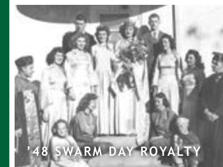
'48 SWARM DAY ROYALTY