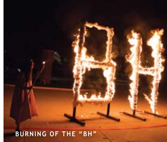
BURNING OF THE "BH"

Since 1962, the Yellow Jacket Stampede Rodeo has continued to embody the western heritage of the Black Hills. In 2017, the BHSU Rodeo Team swept the Will Lantis Yellow Jacket Stampede team titles winning men's and women's All-Around honors.