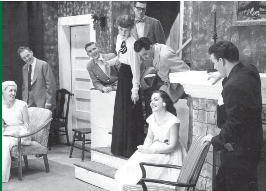
A 1955 BHSU performance of The Torchbearers .