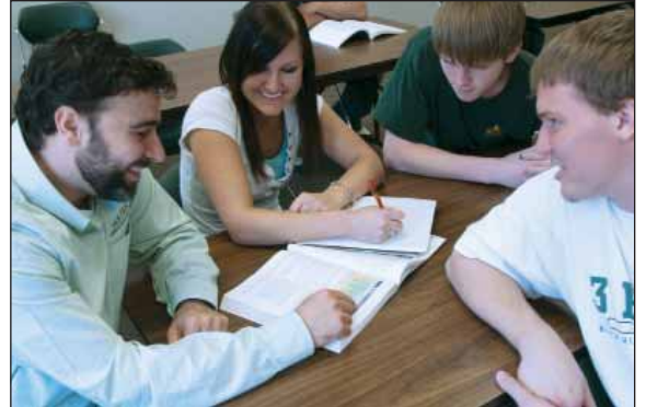
Black Hills State University will now offer two new degree options to its course listings. The South Dakota Board of Regents approved a new bachelor's degree, general studies, and an additional major, corporate communication.