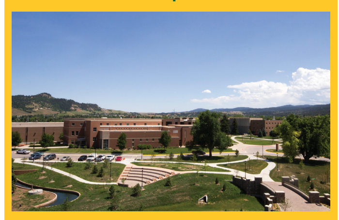
BHSU plans to install solar panels this summer.

Black Hills State University is making plans for a solar panel installation that could potentially be the largest in the state. The solar project is the latest of many energy saving and sustainability initiatives on campus.